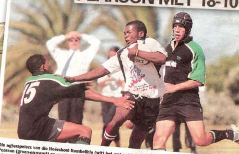
Die agterspelers van die Hoërskool Itembelihle (wit) het omtrent baljaar in hul span se oorwinning van 18-10 oor Pearson (groen-en-swart) se eerste rugbyspan het die knie gebuig teen die besoekende Itembelihle se eerste span. Op foto's slaan aanvallers van Itembelihle se agterspelers 'n gaping.